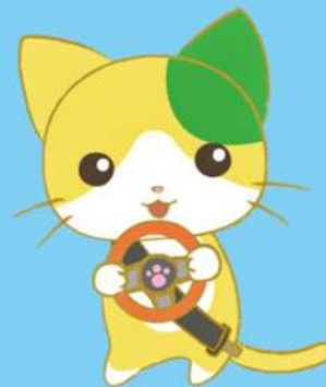
Saga Prefecture traffic safety mascot: Manya

There are increasingly more cases where expensive compensations must be paid for bicycle accidents.